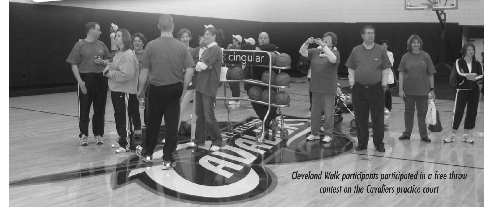
Cleveland Walk participants participated in a free throw contest on the Cavaliers practice court