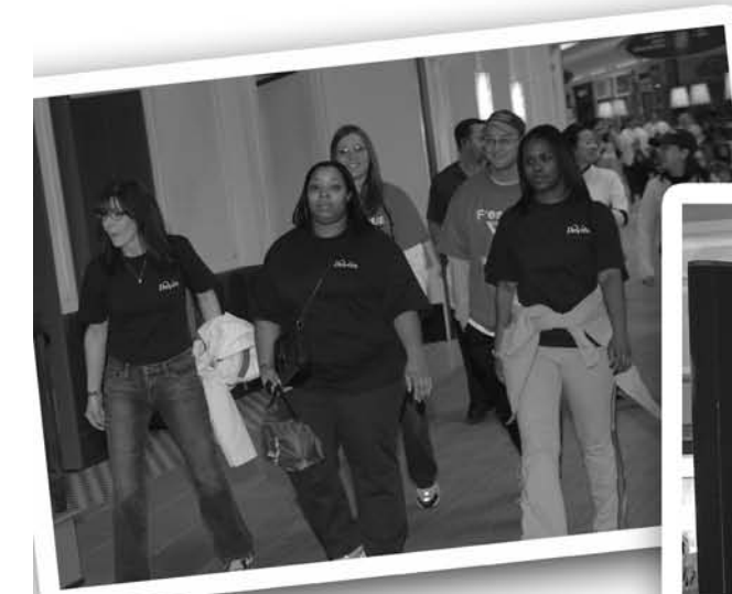
Walkers at Polarix

company for correction of anemia in diabetic patients that have kidney disease. There are other studies in areas such as systemic lupus erythematosus (SLE), iron deficiency in chronic kidney disease and dialysis patients, focal segmental glomerulosclerosis (FSGS), IgA Nephritis and other areas. To participate in these research studies or if you have any of the conditions mentioned above and would like more information, you can call 1-800-293-5081. The research staff will be happy to answer your questions.