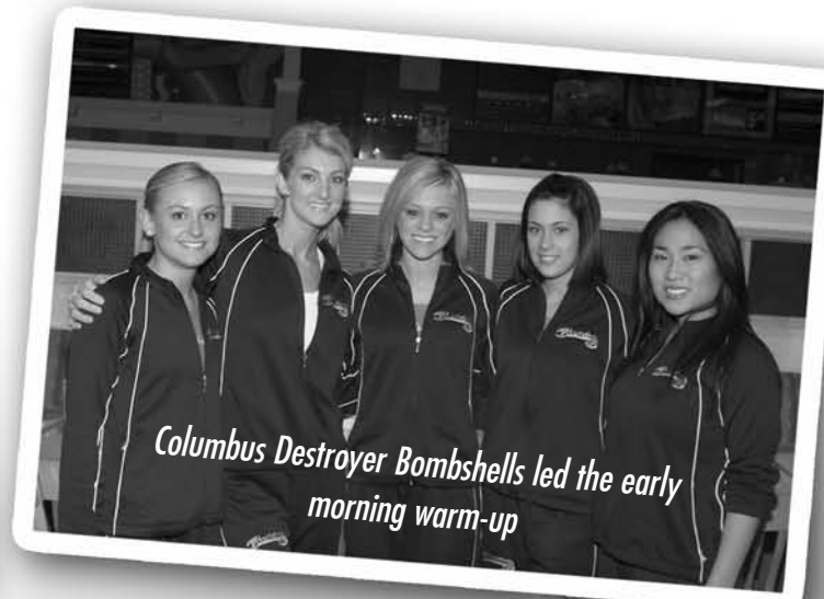
Columbus Destroyer Bombshells led the early morning warm-up