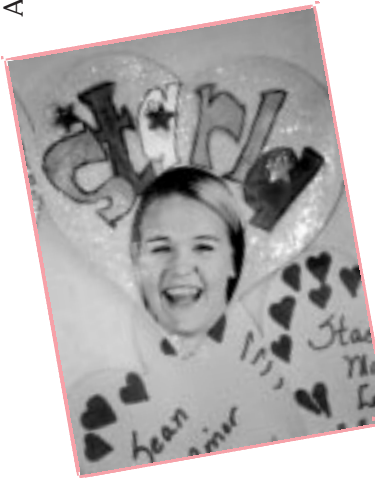
Donor families decorated paper hearts displayed during the Donor Recognition Ceremony to honor their loved ones.