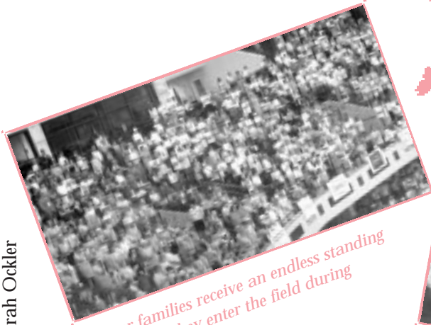
Donor families receive an endless standing ovation as they enter the field during Opening Ceremonies.