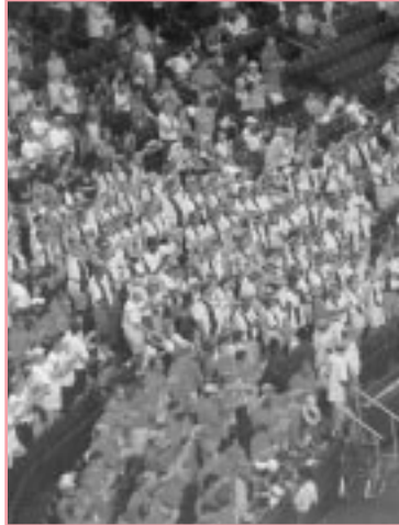
Recipients stand and cheer to welcome donor families to the Games.