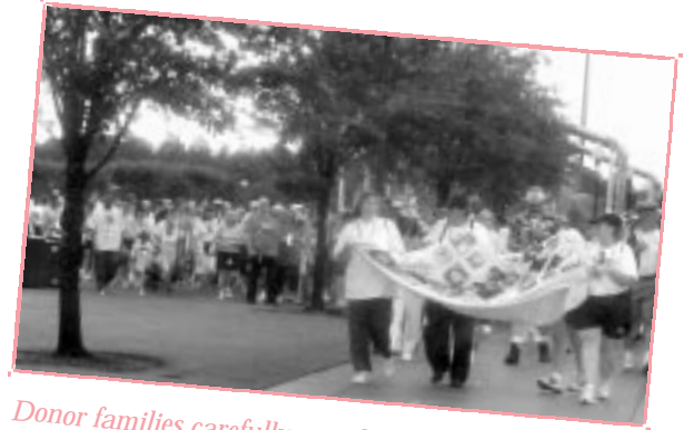
Donor families carefully guard the National Donor Family Quilt as they prepare to enter the field during Opening Ceremonies.

The mission of the National Donor Family Council is to enhance the sensitivity and effectiveness of the organ and tissue procurement process, to provide opportunities for families to grieve and grow, and to utilize the unique perspective and experiences of these families to increase organ and tissue donation.