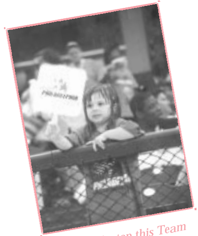
Rain doesn't stop this Team Philadelphia member from cheering on the donor families during Opening Ceremonies.