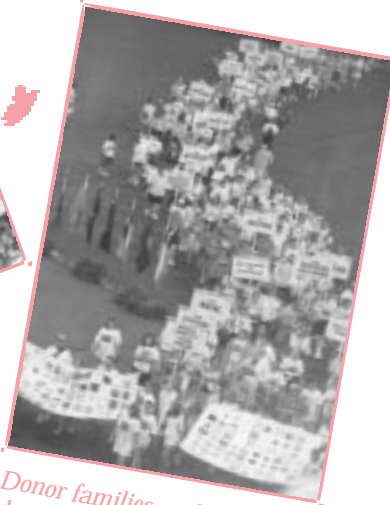
Donor families and living donors march across the field during Opening Ceremonies in honor of those who have given the Gift of Life.