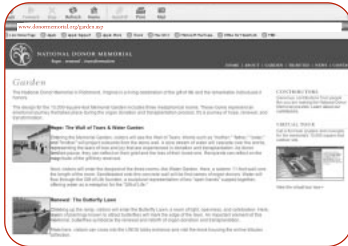
Home page for the Donor Memorial Garden's online virtual tour.

If you will be traveling near Richmond, consider adding a visit to the Memorial Gardens to your trip.