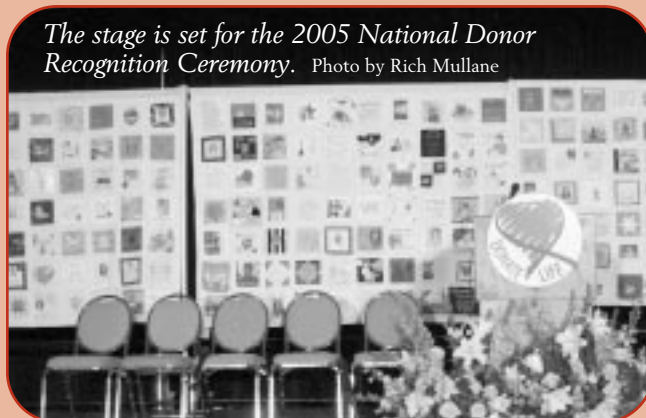
The stage is set for the 2005 National Donor Recognition Ceremony.

FOLLOWING THIS STORY, WE DISCUSSED the importance of finding ways to cope with the loss. One of the most profound ways in which I have coped is through working with organizations such as the National Kidney Foundation and my local procurement agency, Carolina Donor Services. Everyone who was present agreed with me that service is a wonderful way to do something positive and productive with what has happened in our lives. We spent time discussing ways to cope with loss. Most importantly, we found the importance of sharing our grief and seeking assistance if the loss interferes with daily functioning. Many noted how difficult it was to recognize they had to reach out for help, but how rewarding was the outcome when they did so.