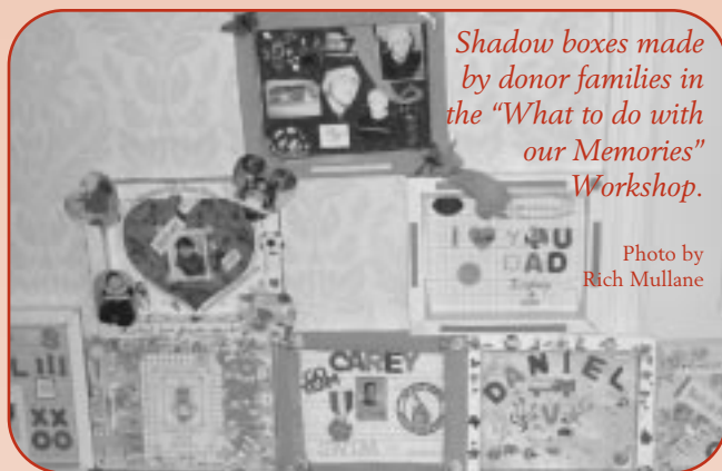
Shadow boxes made by donor families in the “What to do with our Memories” Workshop.

FIRST, I HAVE YET TO SEE a patient who was not extremely grateful for “the gift of life”—so much so that often the recipient is overwhelmed by the enormity of the gift and the generous spirit which these families possess at such a tragic moment in their lives. The recipient is always aware of the fact that while he or she is always elated at beating death, there is a family out there somewhere planning a funeral. This naturally leads to a sense of “survivor guilt” that often causes him or her to question his or her own worthiness of this precious gift. Frequently, the recipient has also come to know fellow transplant candidates from education classes, support groups and clinic waiting rooms. Candidates often ask about one another when they have not seen someone for a period of time.