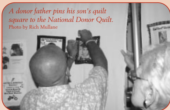
A donor father pins his son's quilt square to the National Donor Quilt.

For a free brochure on brain death, please contact the NDFC at donorfamily@kidney.org or (800) 622-9010.