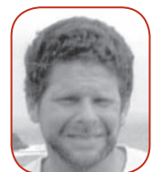
Greg Toland July 19, 1951 – July 22, 2005