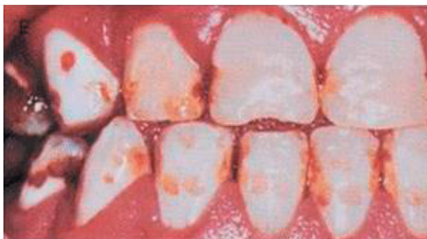
Severe enamel fluorosis occurs in approximately 10%, on average, of children in U.S. communities with water fluoride concentrations at or near 4 mg/L. The condition develops as teeth are forming.

The committee concludes that the current EPA standard does not protect against severe enamel fluorosis. All members of the committee agreed that the condition damages the tooth and that the EPA standard should prevent the occurrence of this unwanted condi-