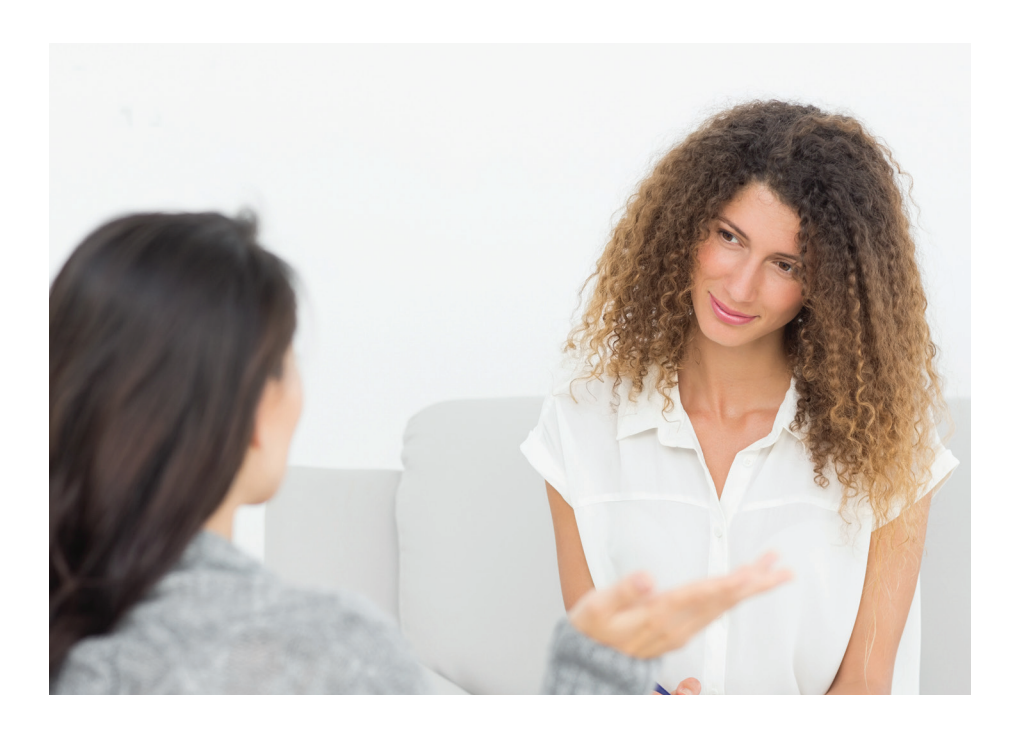
Five Ways to Inspire Living Kidney Donation