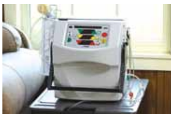
RECLAIM YOUR LIFE With new portable dialysis equipment, you can receive treatment in the comfort of your own home.

■ Peritoneal dialysis (PD) is a needle-free, easy to learn, portable home treatment. PD is gentle,