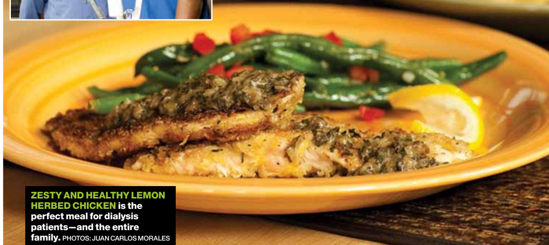
ZESTY AND HEALTHY LEMON HERBED CHICKEN is the perfect meal for dialysis patients—and the entire family.