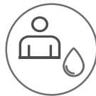
New Dialysis Patients