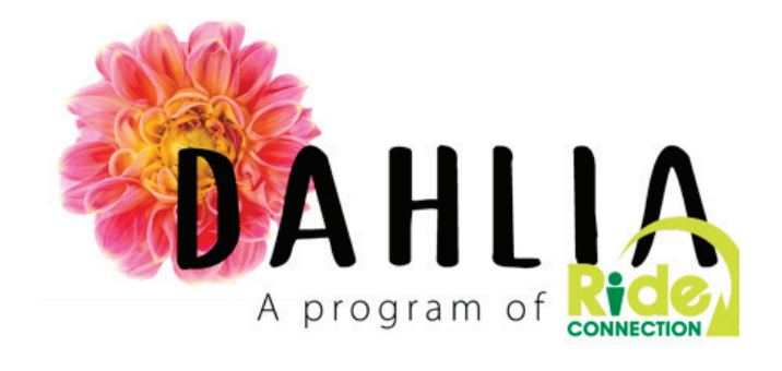
Figure 1. Project logo and vehicle